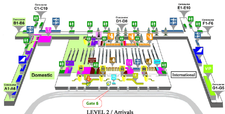
Meeting Point at Suvarnabhumi International Airport, GATE 5