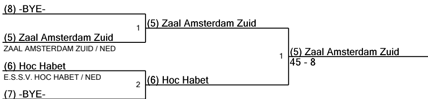
Table of 2 (Pl. 5-6)