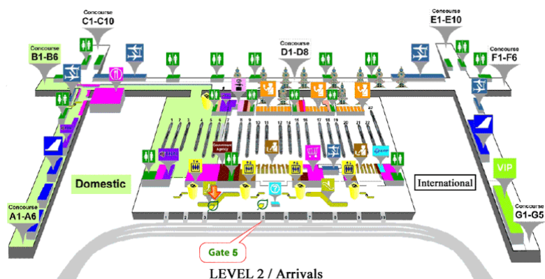
Meeting Point at Suvarnabhumi International Airport, GATE 5

(f) Smoking: Smoking in all air-conditioned public places (including education institutions) is against the law and subject to a 2,000 baht fine. Smoking is also prohibited in all covered areas, including shopping centers, restaurants, cafes and bars (some are allowed to set up special smoking rooms). Smoking is also banned in outdoor eateries, coffee shops, canteens and cafes (some areas are set aside for smoking).