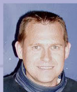
Patrice Lhotellier Foil, Olympic Champion 2000