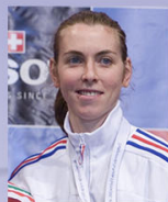
Adeline Wuillème Foil, European Champion 2008