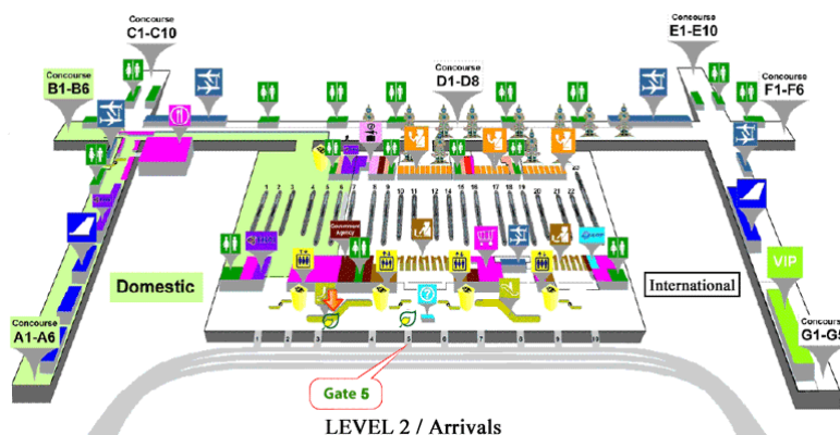
Meeting Point GATE 5 at Suvarnabhumi International Airport

(f) Smoking: Smoking in all air-conditioned public places (including education institutions) is against the law and subject to a 2,000 baht fine. Smoking is also prohibited in all covered areas, including shopping centers, restaurants, cafes and bars (some are allowed to set up special smoking rooms). Smoking is also banned in outdoor eateries, coffee shops, canteens and cafes (some areas are set aside for smoking).